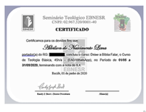
Certificate for the online course

We thank you so much for your interest in the work in Recife and your prayers, especially during this time of quarantine. We appreciate the personal contacts that have been made to check in on us! Our prayers continue for all of you. Keep in touch!