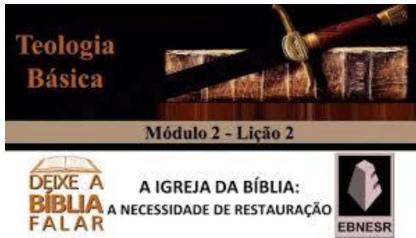
“Let the Bible Speak” Lessons (Module 2, Lesson 2)

At the end of the online course, 28 certificates for “Let the Bible Speak” distance learning were earned in Natal, RN and 40 certificates in Boa Viagem, Recife.